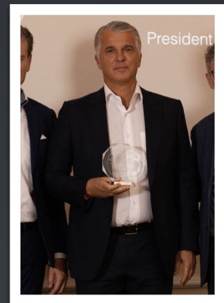
SERGIO ERMOTTI CEO of UBS